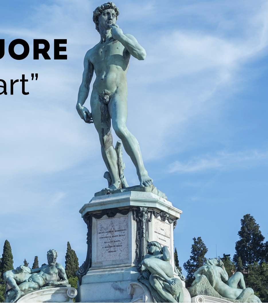
IMMAGINE DEL CUORE “Image of the Heart”